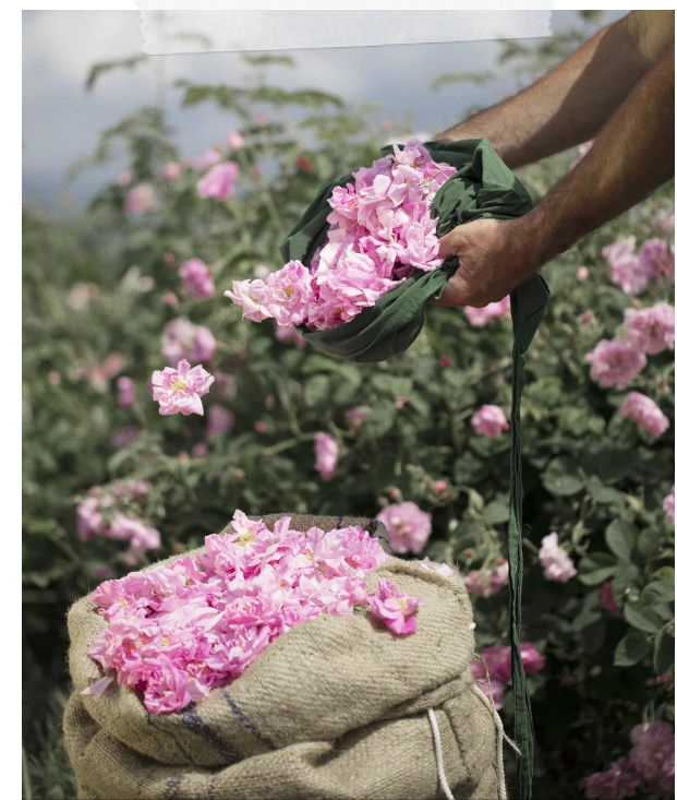
ROSE HARVEST IN GRASSE, FRANCE COCO CHANEL'S FLOWER FIELDS