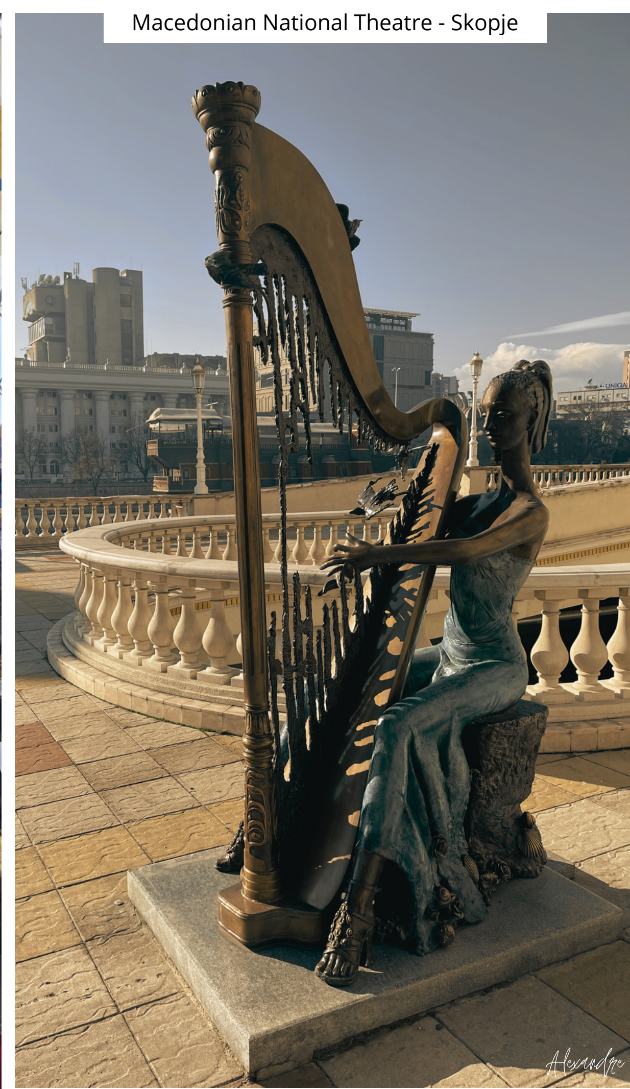
Macedonian National Theatre - Skopje