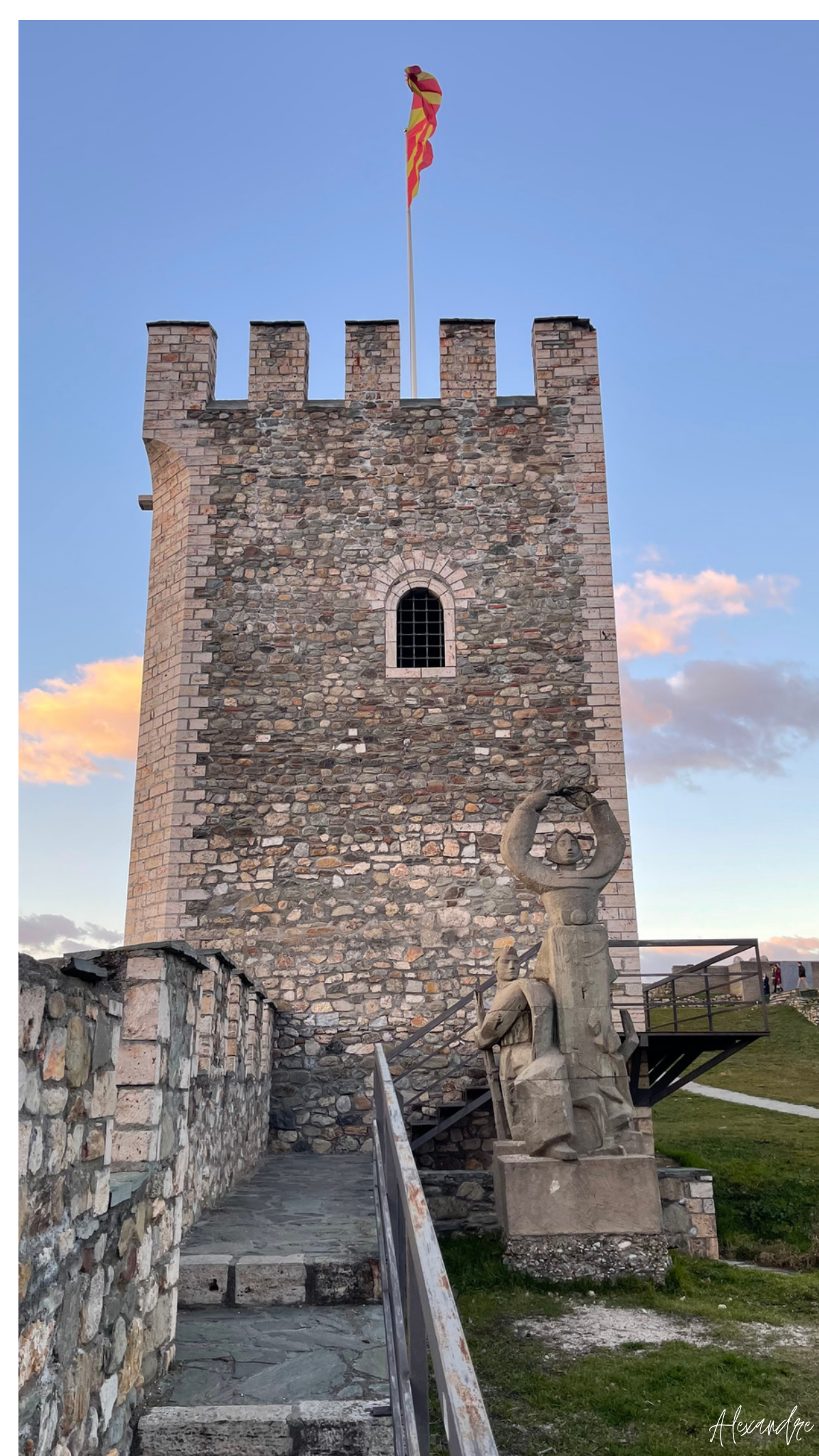
Fortress - Skopje