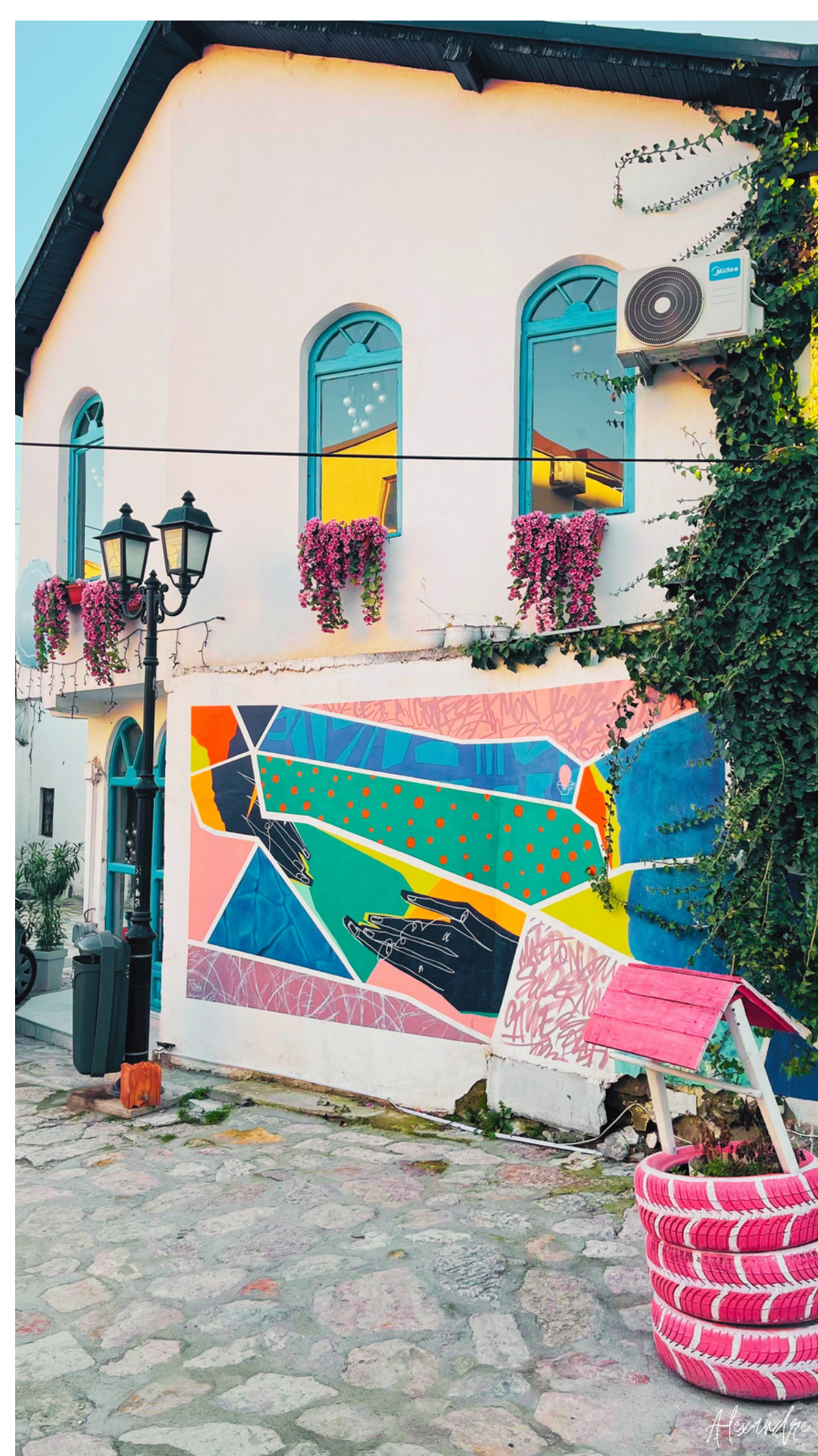
Old bazar - Skopje