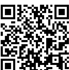
Process Automation Specialist