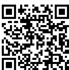
Quality Assurance Tester