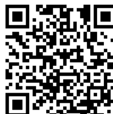
Online Community Manager