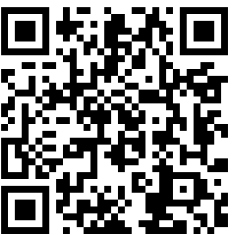
Interpreter Translator and Cultural Facilitator