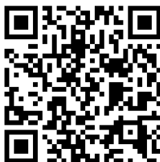
Javascript Developer Engineering